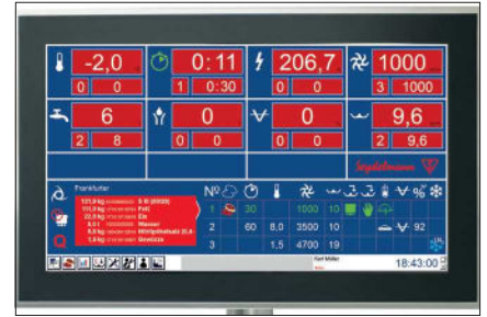
Auto-Command 4000 (optional)