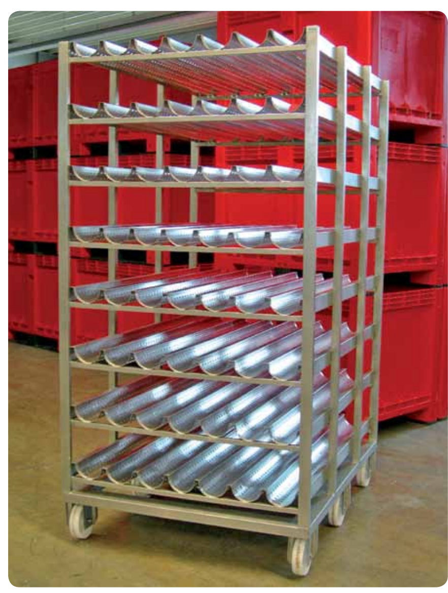
Sausage and cook trolley