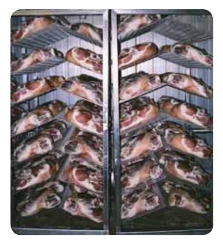
Smoke-trolleys with angle-grids for ham