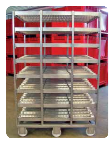
Solid frame construction